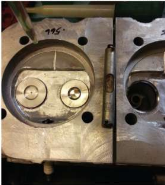
After: The above picture shows the modified head. As you can see I CC'd the chamber so I could check the compression ratio.

full .100" away from the flat of the head, and you wonder why 110 heads spark knock? I took out .085" off the gasket surface and that left .015" for a gasket step. That drastically raises the